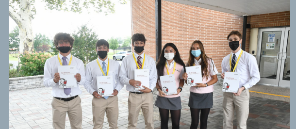
The Crusader is Printed! The members of the Class of 2021 should have received their yearbook. If you didn't be sure to reach out to

+13017158592,,88373609014#,,,,*820860# US (Washington DC) Meeting ID: 883 7360 9014 Passcode: 820860 Find your local number: https://us02web.zoom.us/u/kbKQu8xbAk